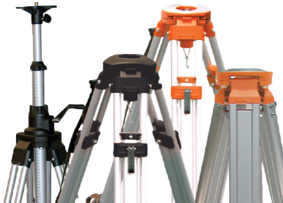
Full Range of Tripods to fit every job